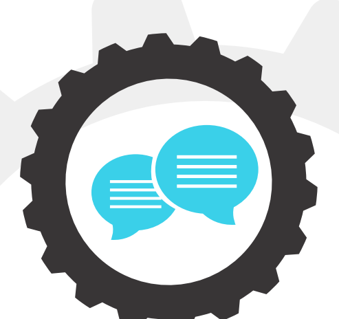
A SKILLED COMMUNICATOR