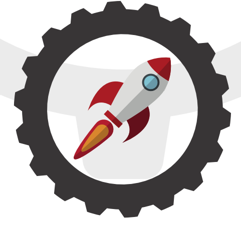
A COLLEGE-READY LEARNER