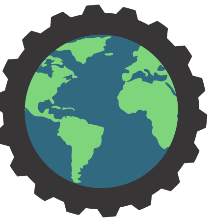
ADAPTABLE & PRODUCTIVE